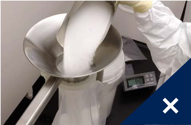
THE NARROW OPENING USED WITH MANY LIQUID-DERIVED CONTAINERS CAN MAKE THEM DIFFICULT TO FILL.

ILC Dover's EZ BioPac® system, for instance, was designed by DoverPac® Containment Systems engineers from scratch, specifically for powder handling in the biopharmaceutical industry. Their focus from the beginning was to get the usability of the system just right. Furthermore, the EZ BioPac system is a true three-dimensional design, allowing for enhanced flow and control of the powder, unlike its two-dimensional competitors.