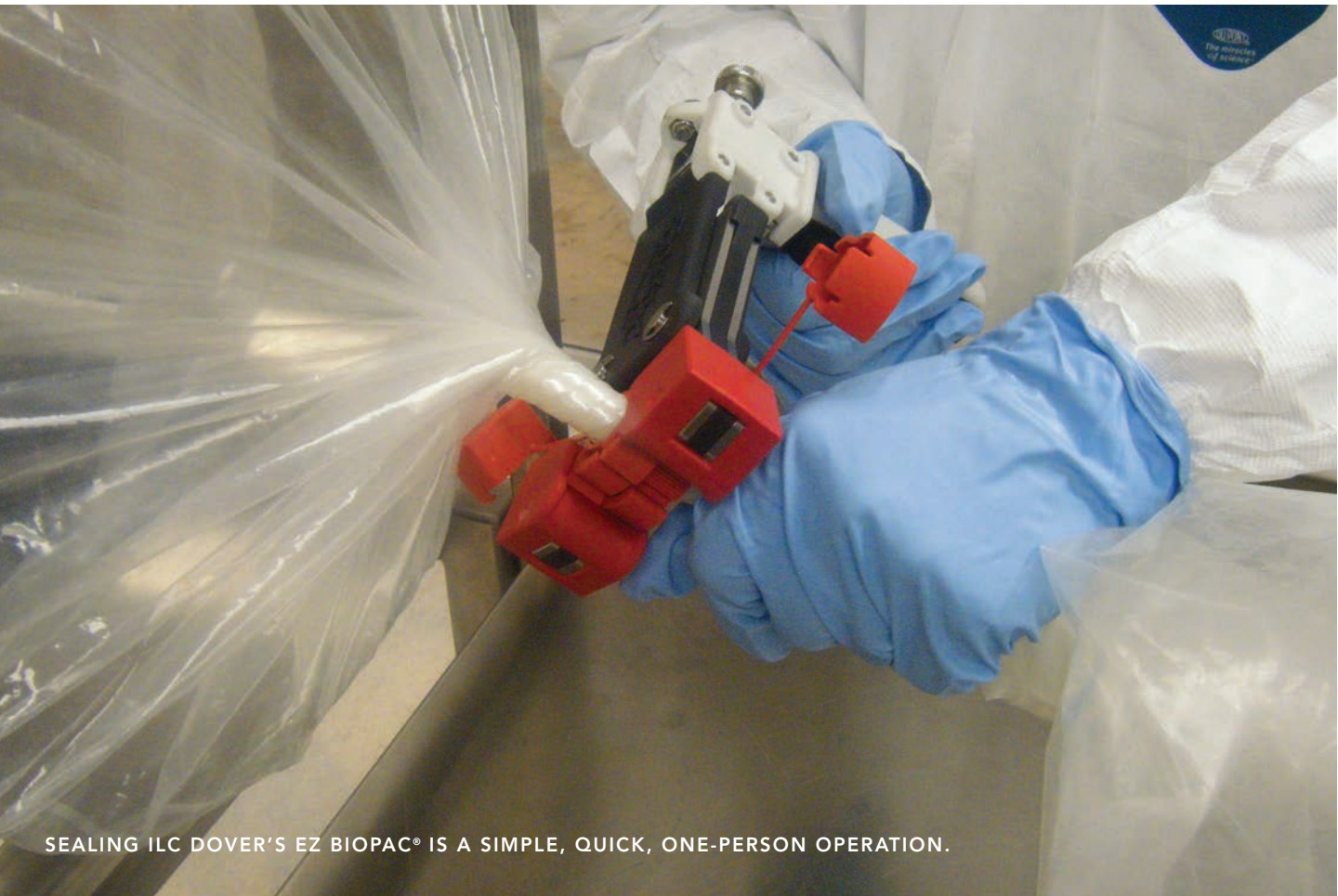
SEALING ILC DOVER’S EZ BIOPAC® IS A SIMPLE, QUICK, ONE-PERSON OPERATION.

The potential for surface contamination is thereby drastically reduced, and sealing and handling are much easier and cleaner.