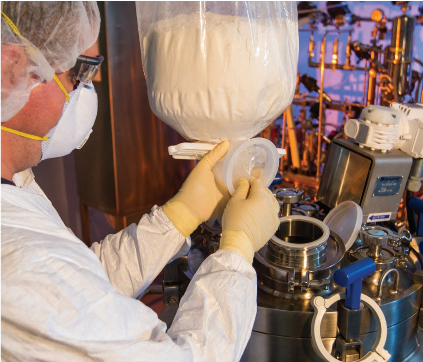
CONTAINMENT AND TRANSFER SYSTEMS SHOULD BE EASY TO FILL AND FAST TO DISPENSE.

Many biopharmaceutical manufacturers are implementing single-use containment and transfer of media and buffer materials to prevent feedstock contamination and promote worker safety. Choosing the proper containment system can have a significant impact on productivity and profitability.