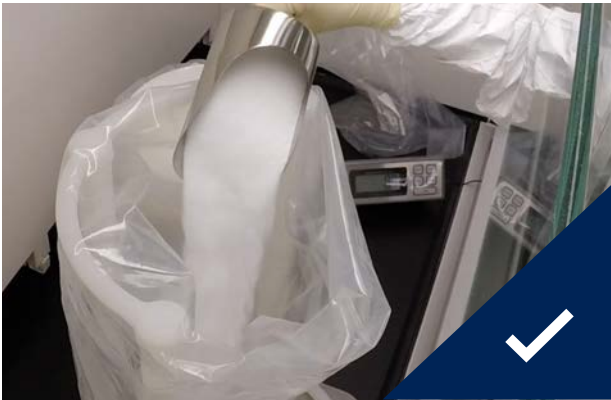
WIDE OPENINGS AND A PROTECTIVE OUTER SKIRT MAKE ILC DOVER'S EZ BIOPAC® CONTAINERS EASY TO FILL, EASY TO SEAL CLEANLY AND EASY TO HANDLE DURING TRANSPORT.