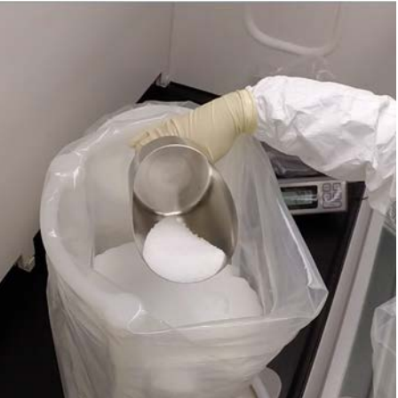
THE EZ BIOPAC® CONTAINER'S WIDE OPENING MAKES IT EASY FOR THE OPERATOR TO FINE-TUNE THE FINAL WEIGHT.

With narrow-neck bags, fine-tuning the final weight is awkward, requiring use of a narrow ladle and cumbersome manipulation of the filled bag.