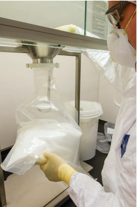
OPERATOR LIFTS NARROW-NECK BAG TO REMOVE POWDER WITH SMALL LADLE TO FINE-TUNE WEIGHT.